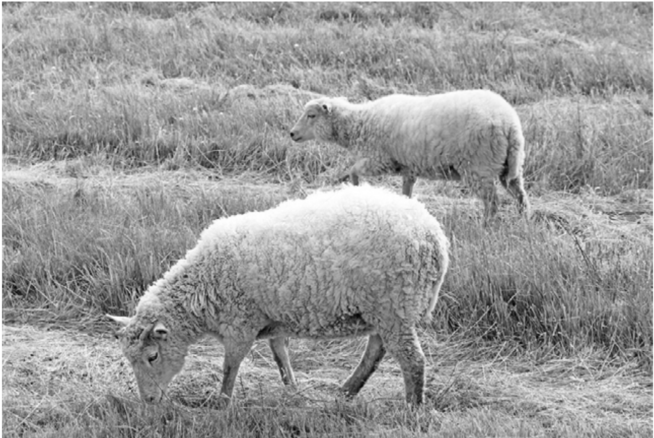
THURSO, SCOTLAND, UNITED KINGDOM • WILLIAM M. LOVING

Note: Certain contact information (e.g., Coordinators, Reference Persons, Teachers, and Workshops) is available in the print edition, but to protect privacy online, is only available for digital subscribers at this password-protected page. The password is available only to subscribers.