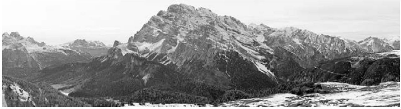
DOLOMITIC ALPS, ITALY • LYNDALL KATZ