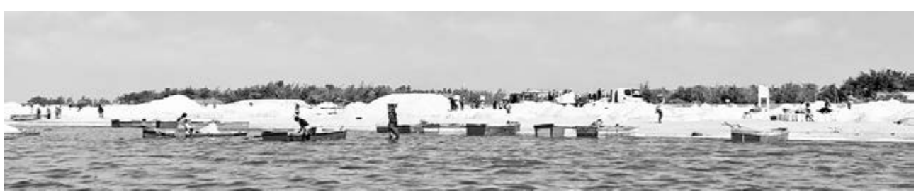
LAC ROSE, SENEGAL •