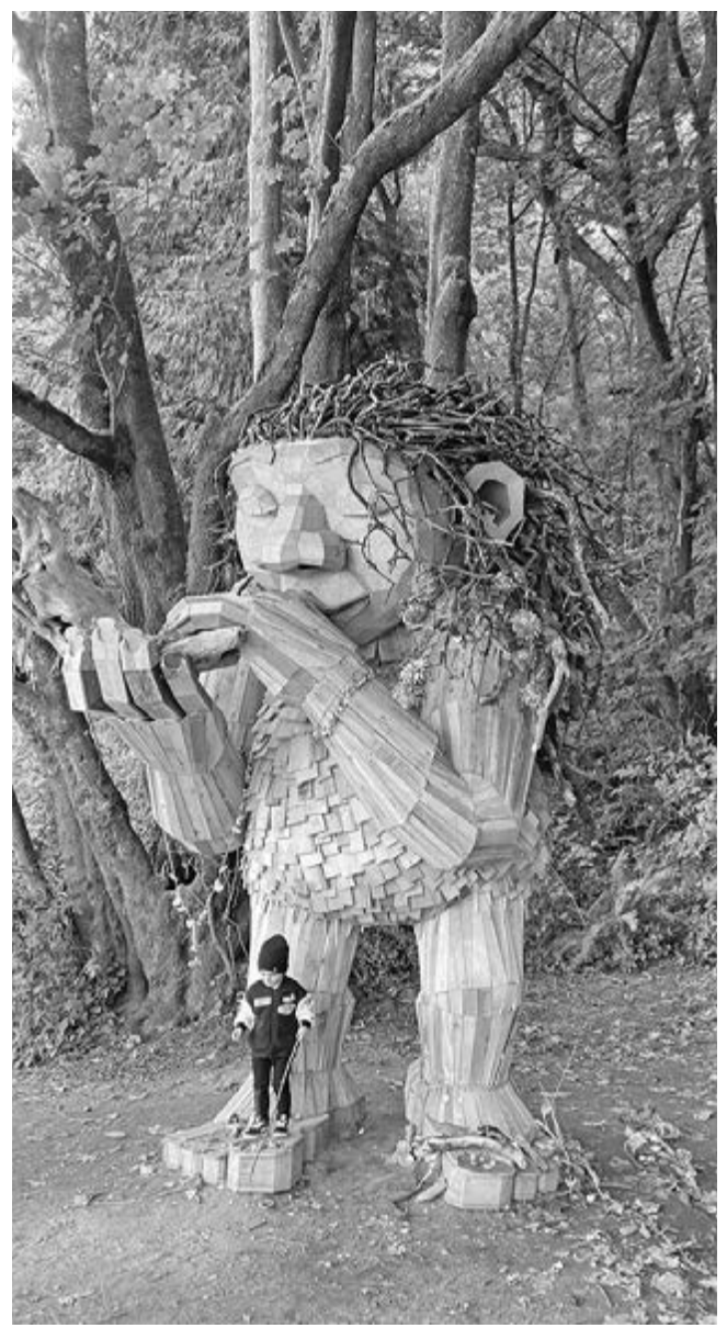
THOMAS DAMBO'S BRUUN IDUN TROLL, IN LINCOLN PARK, SEATTLE, WASHINGTON, USA • TIM JACKINS